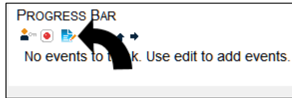
Progress Bar Before Configuration